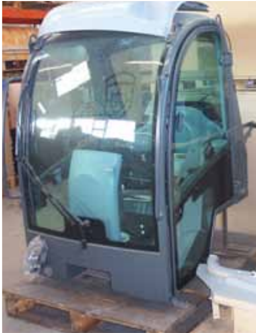
Interior Cockpit Components