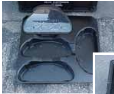
Instrument Panel Insert