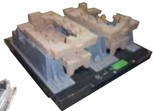
Sandcore Storage and Transport Trays