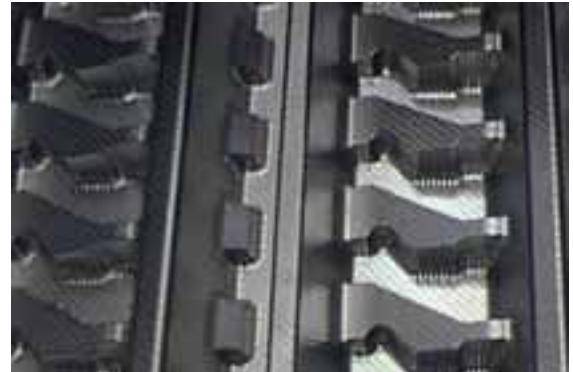
CNC Machined Singlesheet Tool