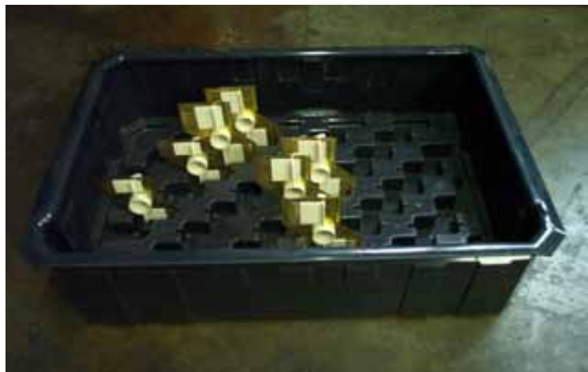
Electronic Modules Tray