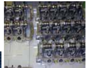
Engine Block Divider