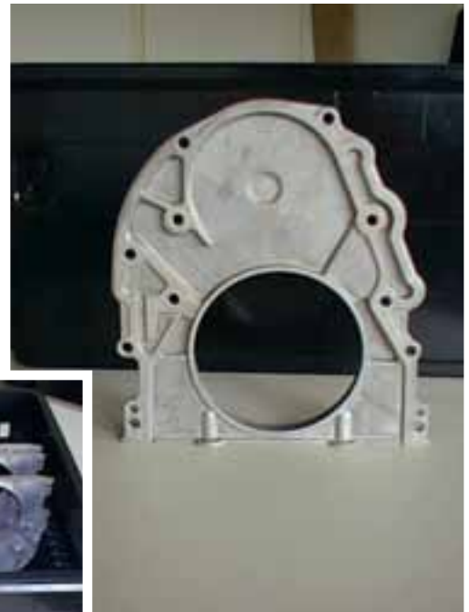
Bearing Block Tray