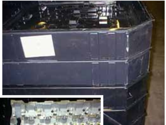
Cylinder Head Tray