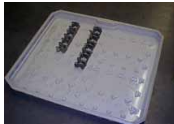
Camshaft Cap Tray