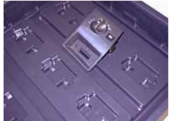
Instrument Panel Tray