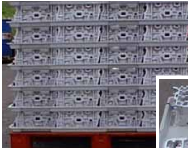
Cylinder Head Divider Sheets