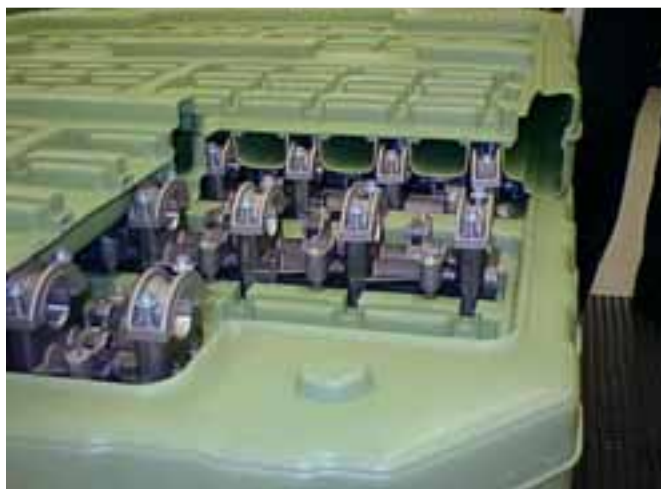
Twinsheet Bearing Block