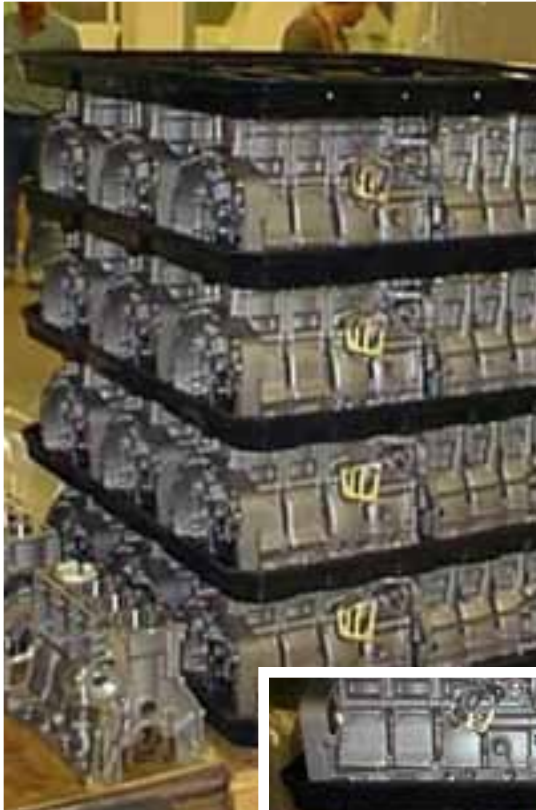
Engine Block Divider Sheet