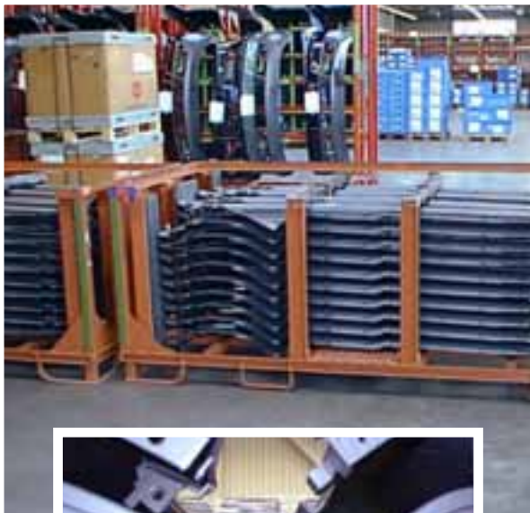
Steel Rack Partition