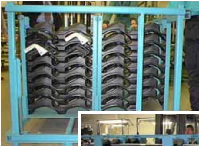
Steel Rack Dividers